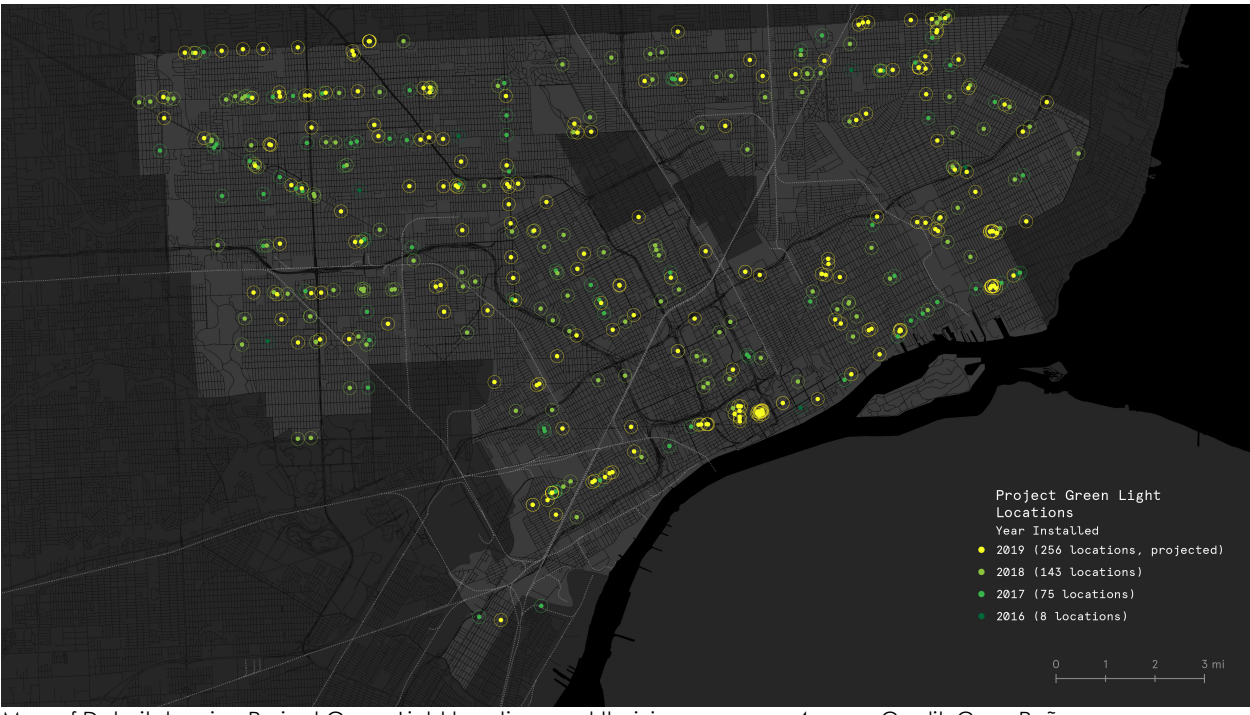
Map of Detroit showing Project Green Light locations and their increase over 4 years. Credit: Cyrus Peñarroyo

PGL was first implemented on January 1<sup>st</sup>, 2016, as a partnership between local business, the City of Detroit, and community groups. On that day, eight gas stations had real-time security cameras connected with DPD headquarters for monitoring (3). In the three and a half years since then, PGL has expanded rapidly. As of June 2019, there are over 550 participating locations in the city, ranging from gas stations, to churches, to reproductive health centers (4).